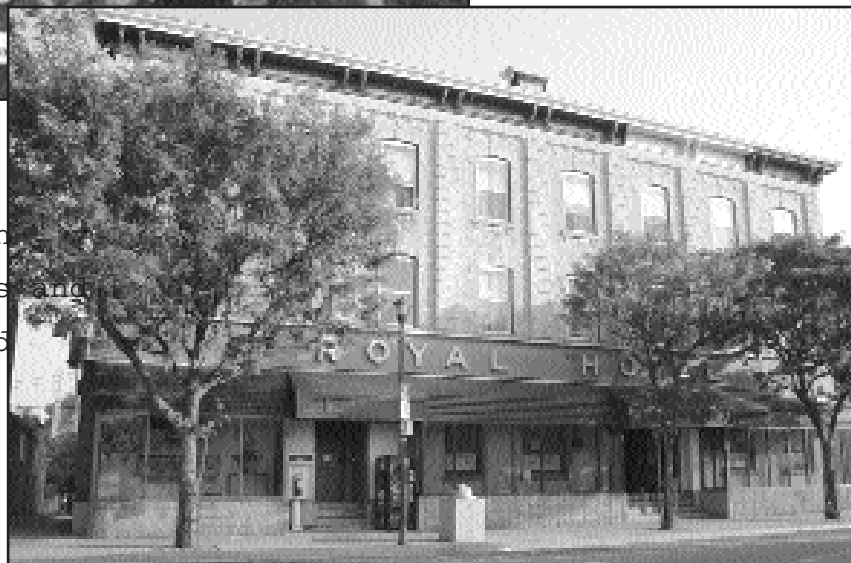
Below: The Royal today.