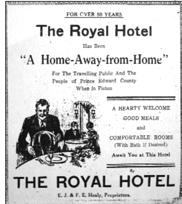
Left: An ad c.1930. Below: A brief history of the Royal appeared in December 1930, confirming the building date.

The Picton-based design company has a strong track record of top-notch building projects throughout the County, including the Town Hill Place condo project now under construction. They have