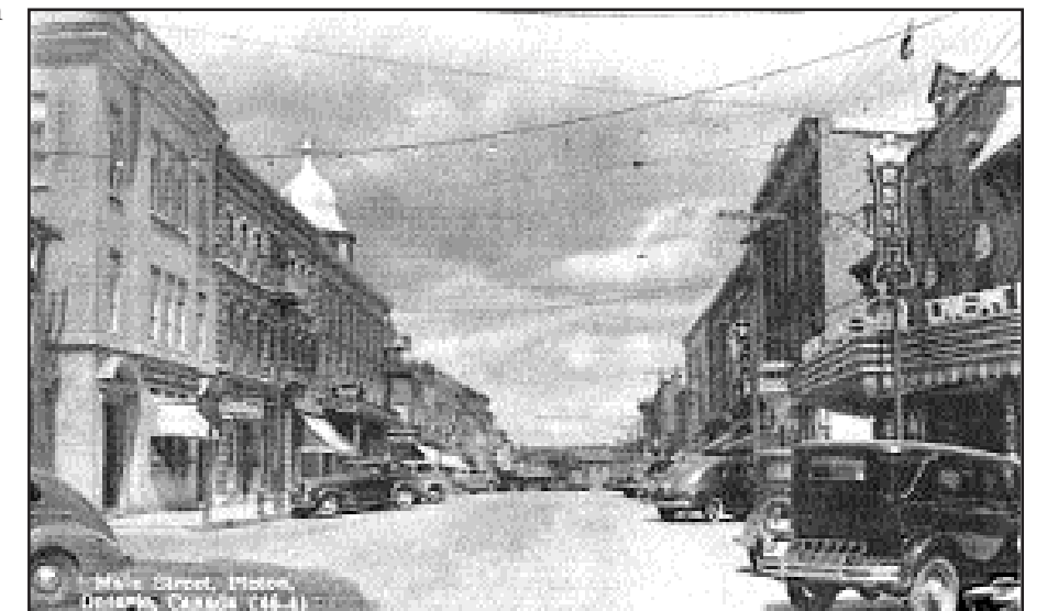
Right: A later view.