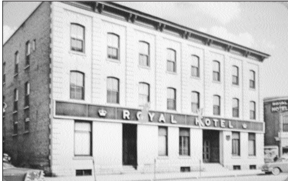
Above: The Royal as it appeared in the 1960s. The balcony extending from the second floor was removed earlier, and much of the brickwork and facade detail obscured by paint. This was much in keeping with the style of the time.

The Royal Hotel – reinvented! Above and right: The preliminary logo and the first sketches of the proposed plan for the Royal. Both of these may change considerably during the course of the project. The second story balcony will return, and three new floors are planned on top.