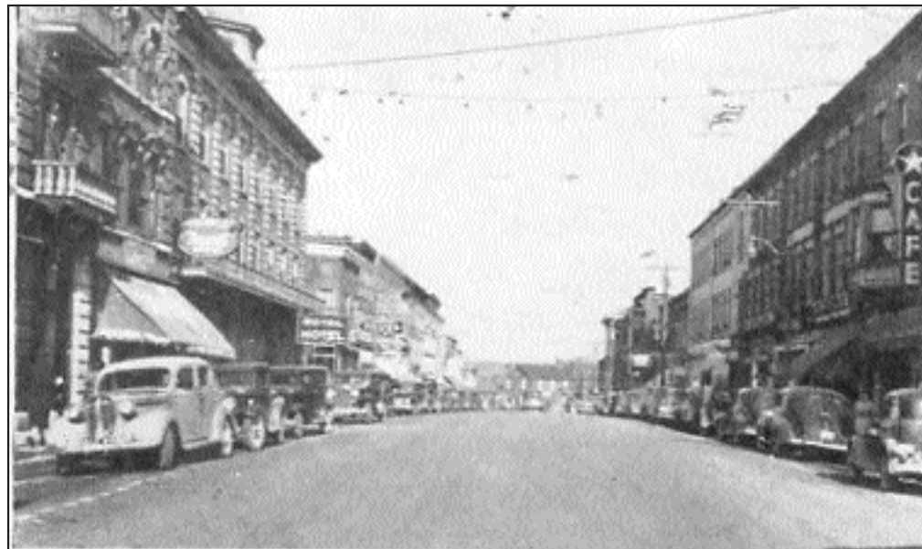
Below: A view of Main Street looking toward the Town Hill. The cupola atop the Royal is just visible on the left, and it added a touch of class to the already-impressive streetscape.

The Royal Hotel has long been a landmark on Picton's Main Street. Since it was built in 1879, the grand old building has served as a stop-over point for stagecoaches, a comfortable roadside inn, a venue for fine dining, rooms for long-term and short-term residents, and as a favorite watering hole and dance spot.