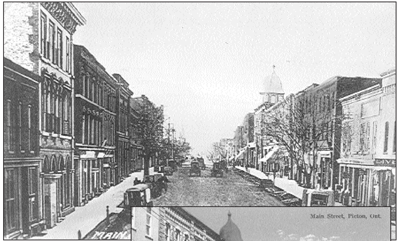
Main Street, Picton, Ont.

Photos courtesy Elliott Sage Design & Construction, Gudrun Gallo, Prince Edward Archives and the Ian S. Robertson postcard collection.