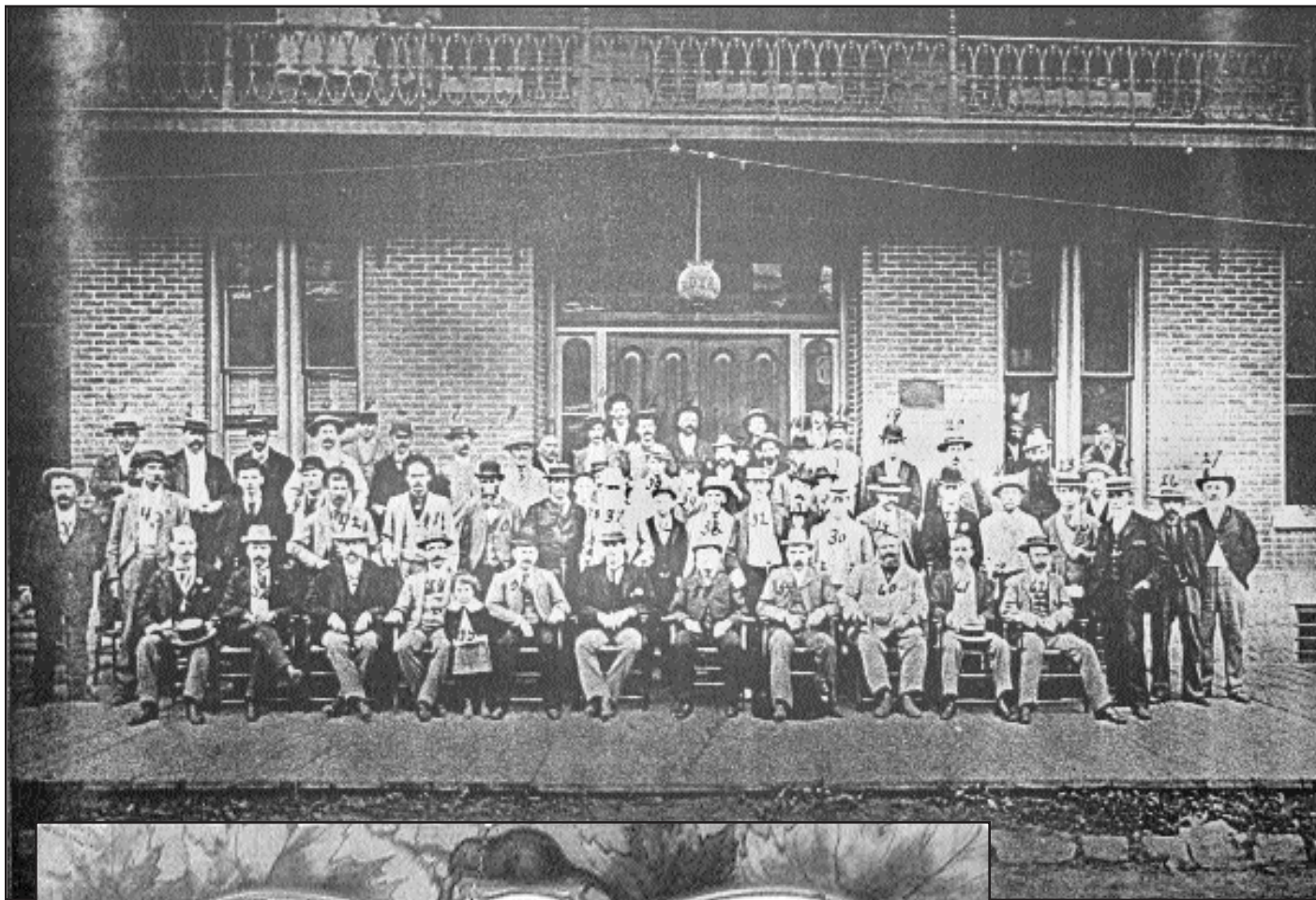
Above: Even in the early days The Royal was a natural gathering spot for groups. In this view the second-floor balcony is clearly seen. Note the deep drop from the sidewalk to the dirt street.