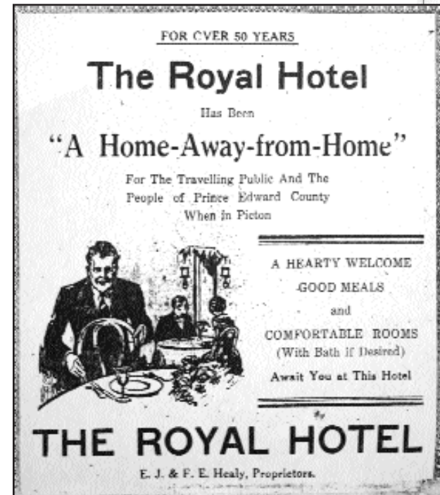
Left: An ad c.1930. Below: A brief history of the Royal appeared in December 1930, confirming the building date.

The Picton-based design company has a strong track record of top-notch building projects throughout the County, including the Town Hill Place condo project now under construction. They have