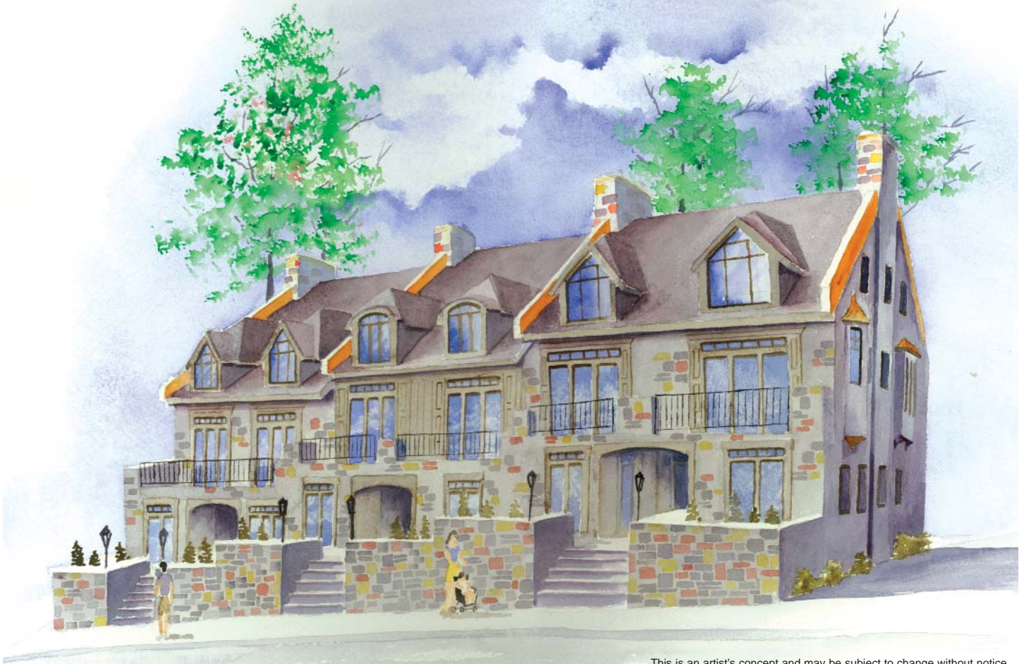
This is an artist's concept and may be subject to change without notice