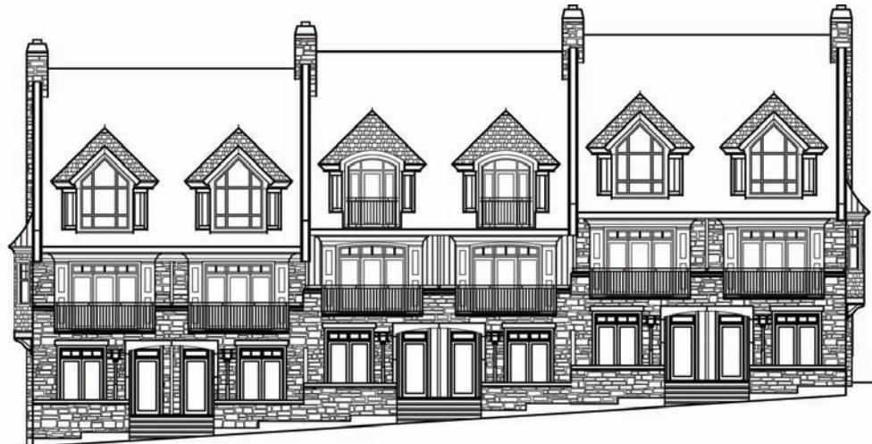
FRONT ELEVATION 1/8" = 1'-0"